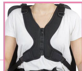
Various trunk vest and pelvic belts available