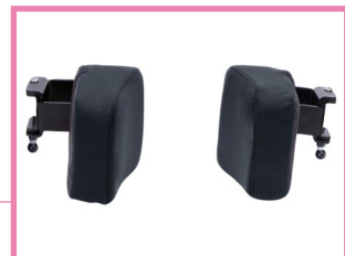
Trunk support swing away