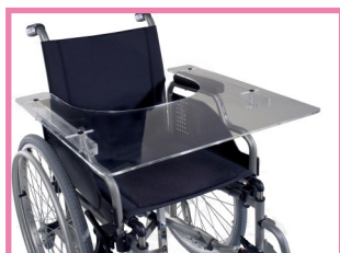
Acrylic tray (also available in wood)