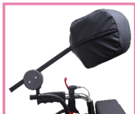
Various headrests available