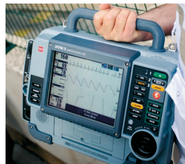
Dual-mode LCD screen with SunVue display

*A variety of customized service options are available.