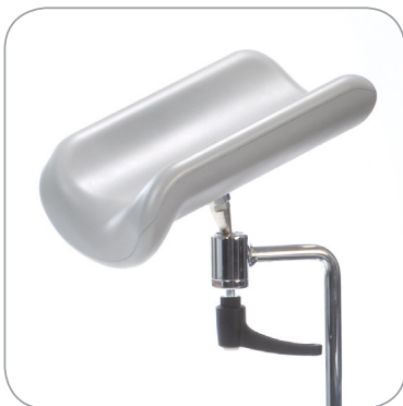
Fully adjustable moulded arm supports