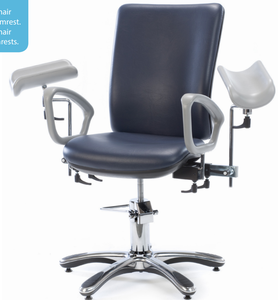
Model MC6155 in Dark Blue