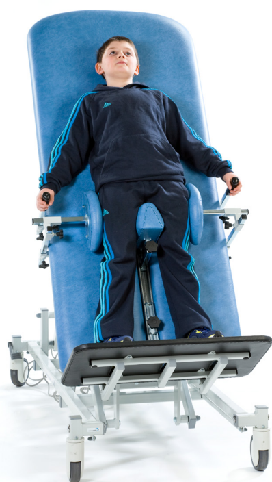
Model ST7651 Colour sky blue