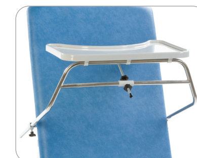
7648 Optional Adjustable Work Table