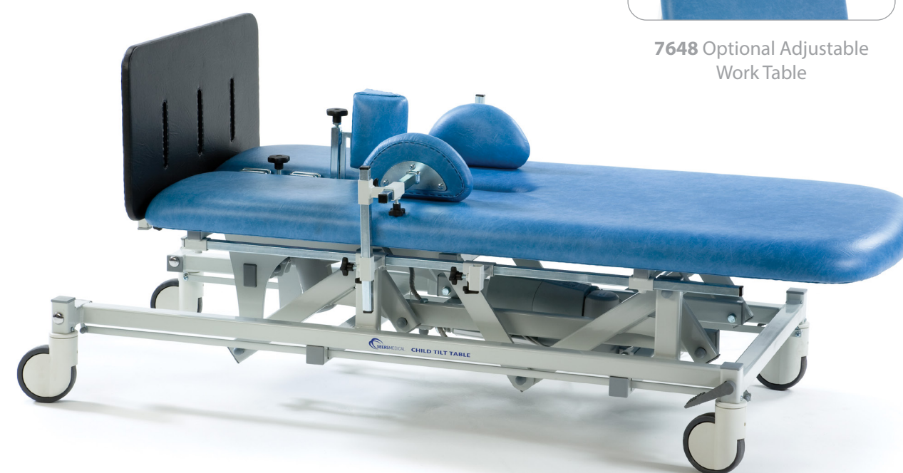
Model ST7651 in horizontal position