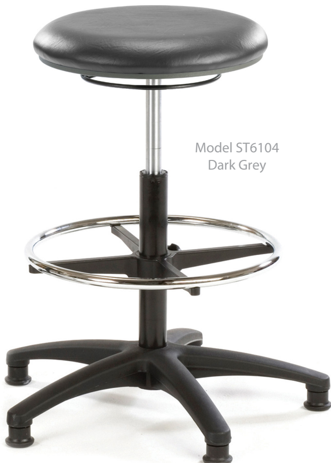
Model ST6104 Dark Grey

New Easy Clean Upholstery System to maximise infection prevention