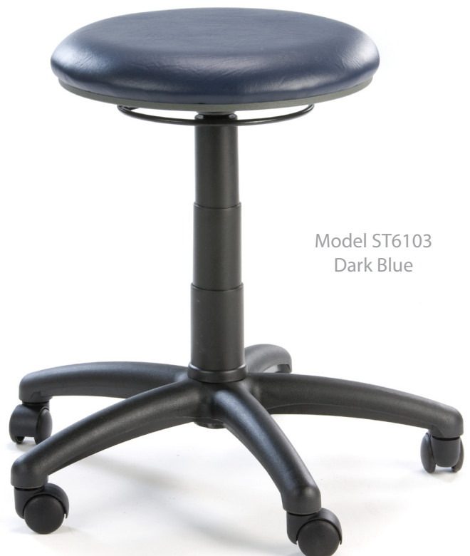
Model ST6103 Dark Blue