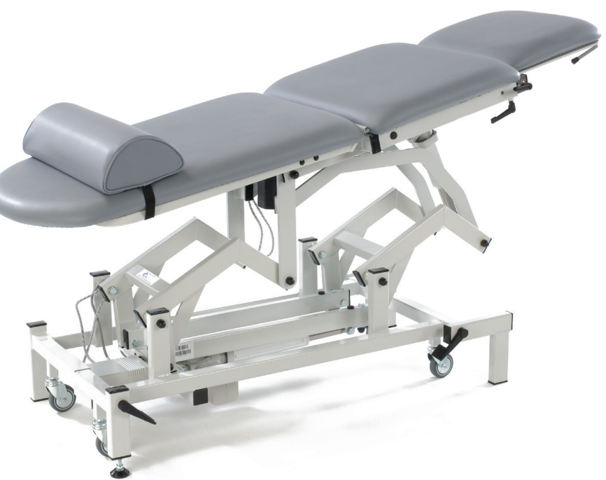
Model MC6158 Sonographers chair standard model. Colour oriflamme