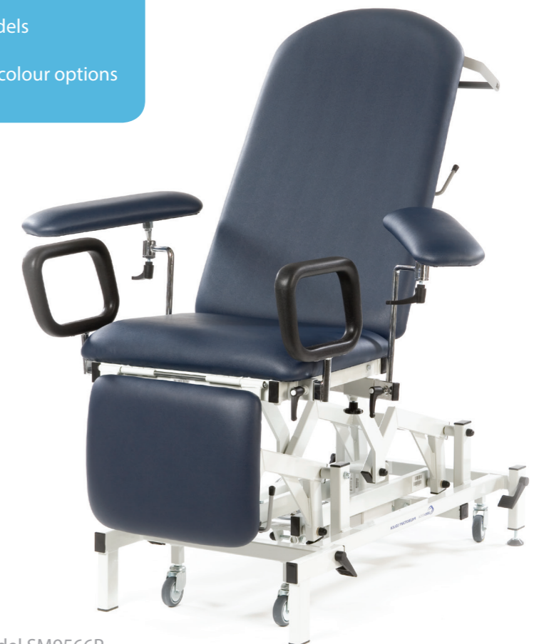
Model SM9566P Colour dark blue