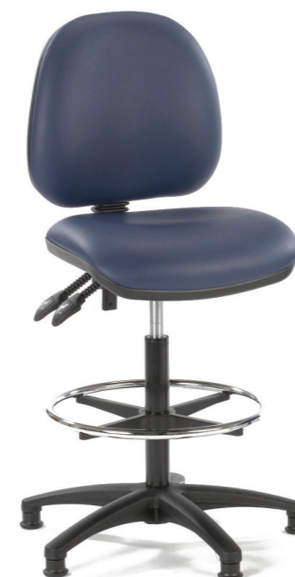
Model 6101 optional matching high operators chair