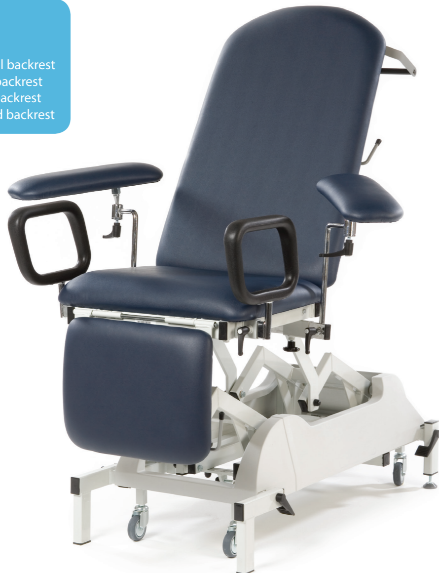
Model SM9566P with optional base cover. Colour dark blue