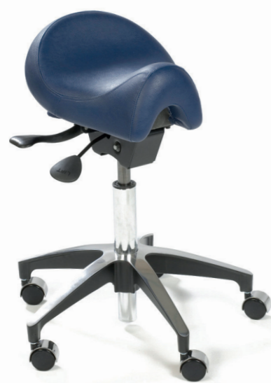
Model 6107 optional matching deluxe saddle chair

See page 48-49 for additional information on our range of optional accessories.