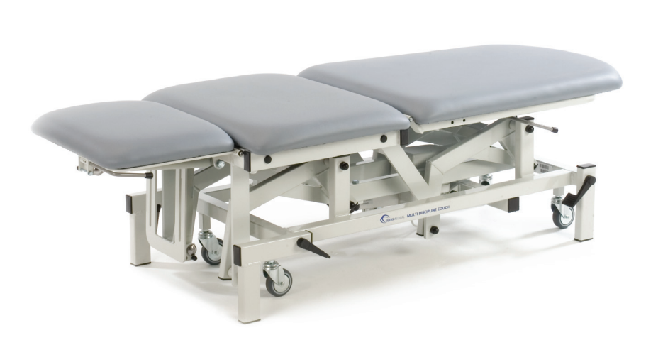
Low patient transfer height

See page 48-49 for additional information on our range of optional accessories.