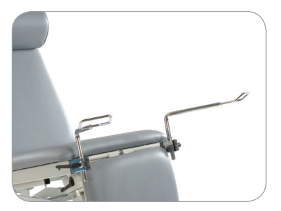
Model 6044 optional lithotomy stirrups