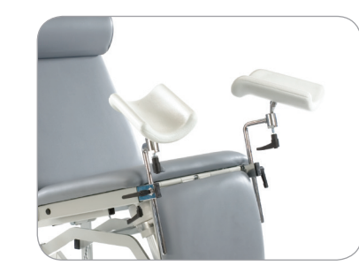
Model 6045 optional leg supports for gynaecology