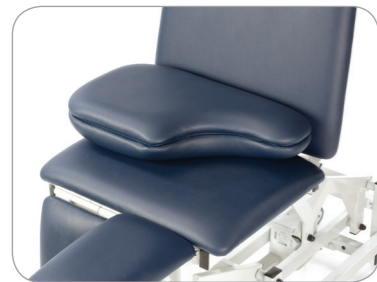
Model 5007 optional orthopaedic full leg seat module