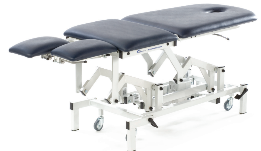
Model SM5565 showing extended patient footrest