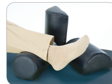
Model 5008 optional knee support roll set

See page 48-49 for additional information on our range of optional accessories.