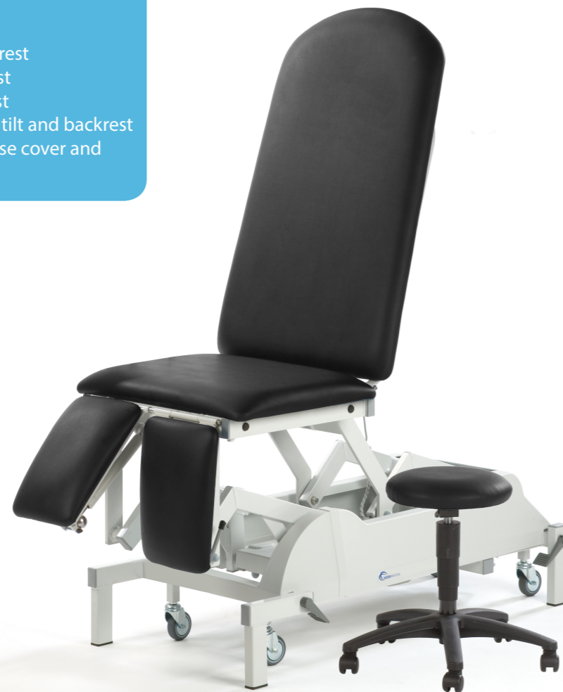
Model SM5585D Colour black