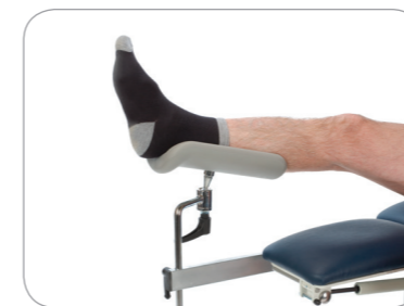
Model 5009 optional orthopaedic leg support attachment