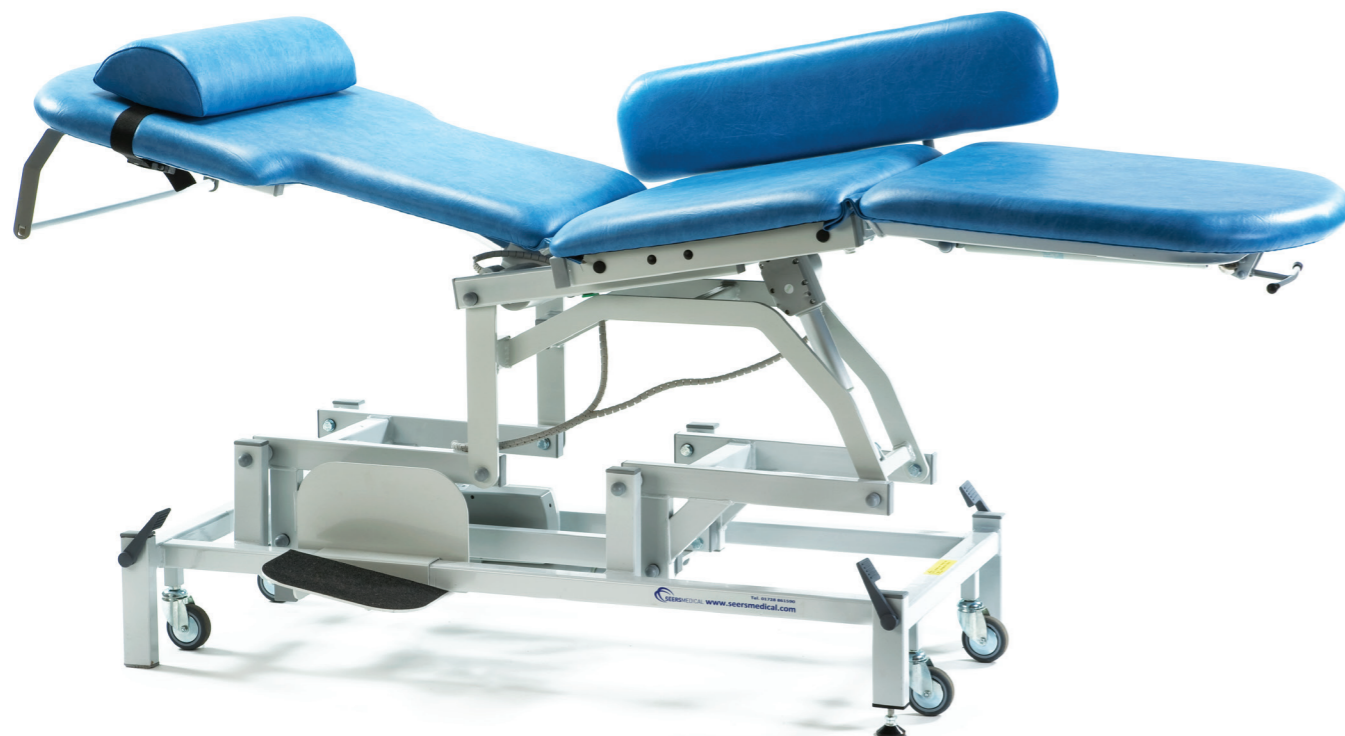
Model SM3590 Colour sky blue