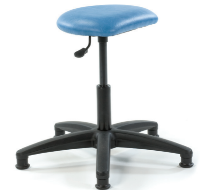
Special design stool provided for clinician, included as standard

See page 48-49 for additional information on our range of optional accessories.