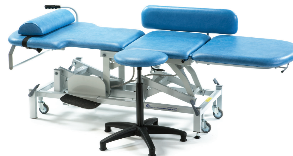
Model SM3590 Colour sky blue