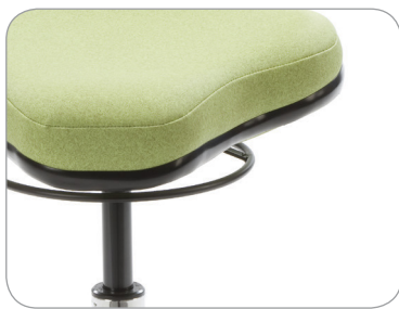
All round height adjustment ring