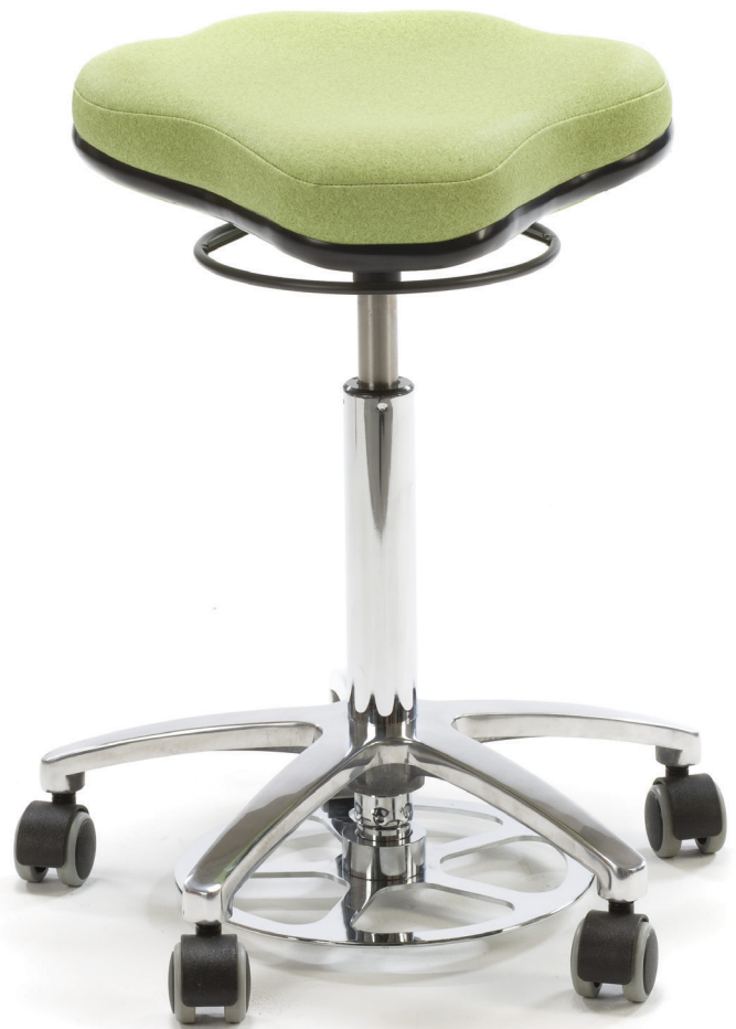
Model MC6169 Dual curve medical stool with foot height control option. Colour Tilleul