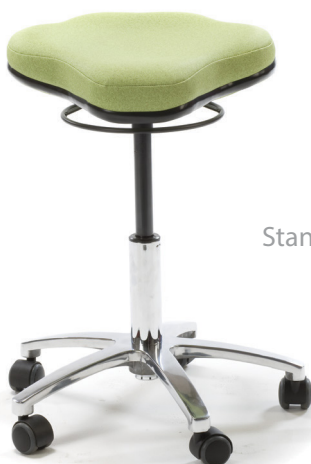
Model MC6168 Standard height model. Colour Tilleul