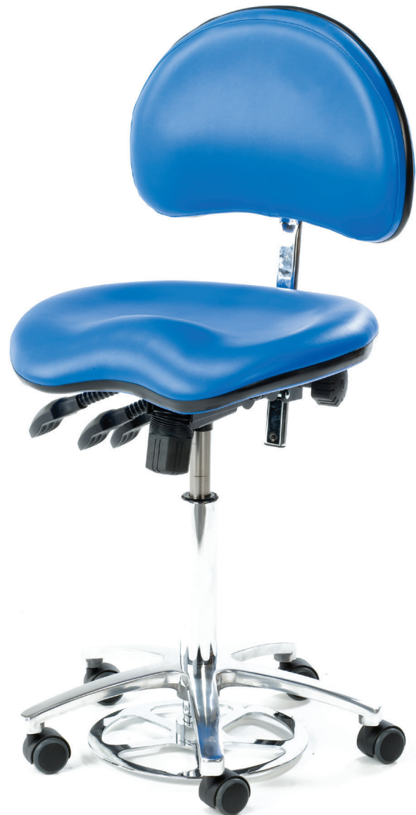
Model MC7213 High model contoured medical chair with optional foot height control