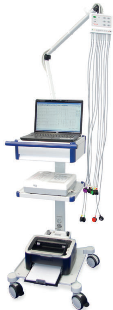
< Example of use >