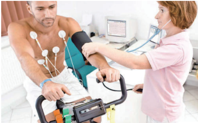
< Example of use >

Ideal module to record and analyze 12-lead ECG