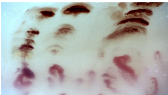
Active Scleroderma Pattern