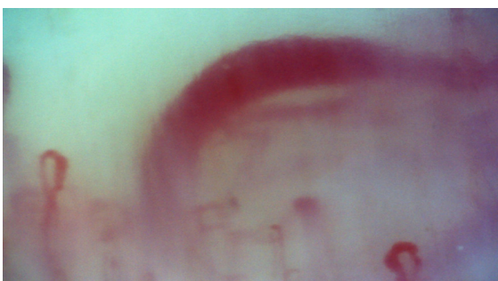
Late Scleroderma Pattern