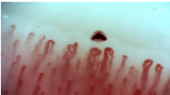
Early Scleroderma Pattern