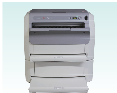
DRYPIX Lite shown optional sheet feeder unit and 2magazines

Specifications are subject to change without notice. All brand names or trademarks are the property of their respective owners. In some countries, regulatory approval may be required to import medical devices. For the availability of these products, please contact your local sales representatives.