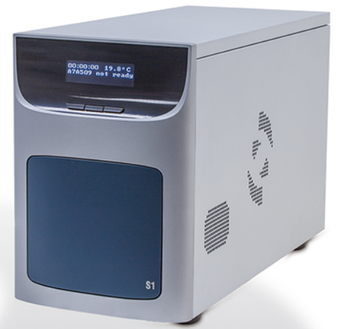
AMPLIX NEW GENERATION THERMOCYCLER (REF 8068)