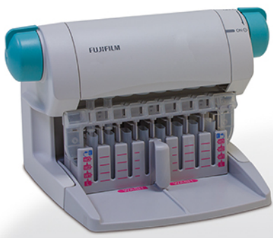
QUICKGENE EXTRACTOR (REF 8074)

500 to 3000 tests per year (1 to 50 tests per week)