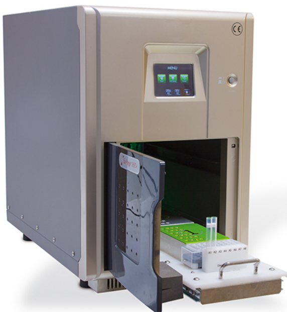
AUTOMATED EXTRACTOR (REF 8059)

10000 tests or more per year (about 150 tests or more per week)