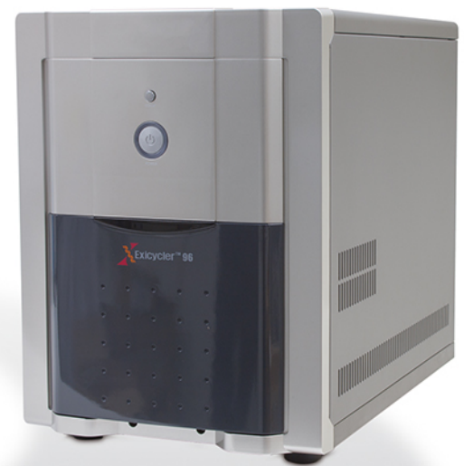
EXICYCLER THERMOCYCLER (REF 8073)