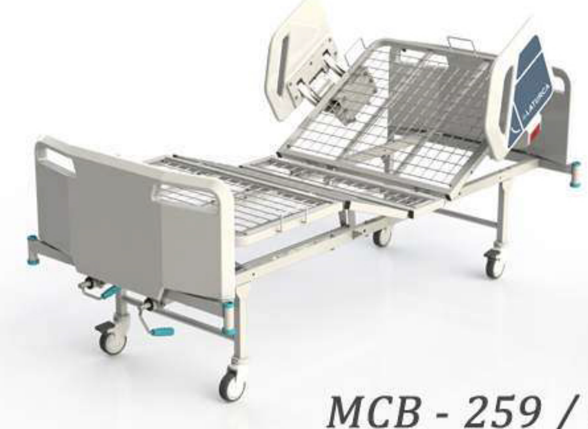
MCB - 259 / G