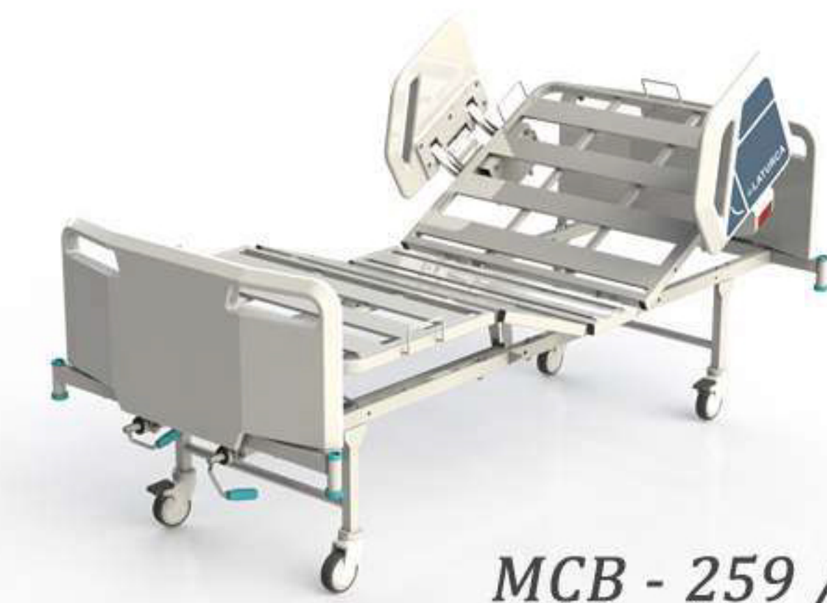
MCB - 259 / T