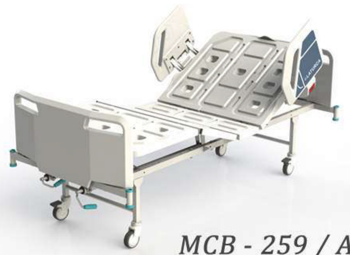
MCB - 259 / A