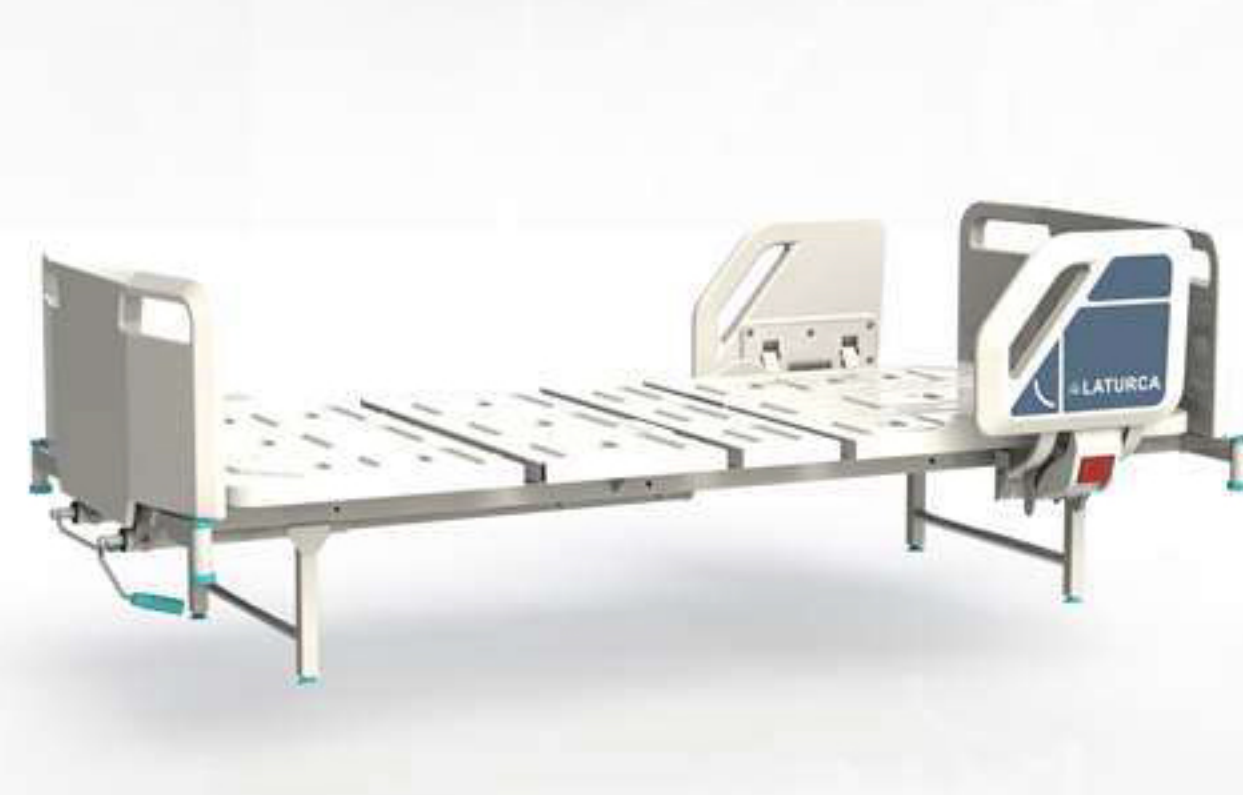
MCB - 259 / A