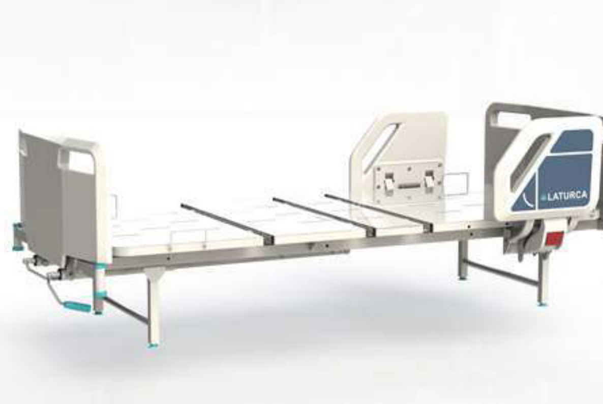
MCB - 259 / M