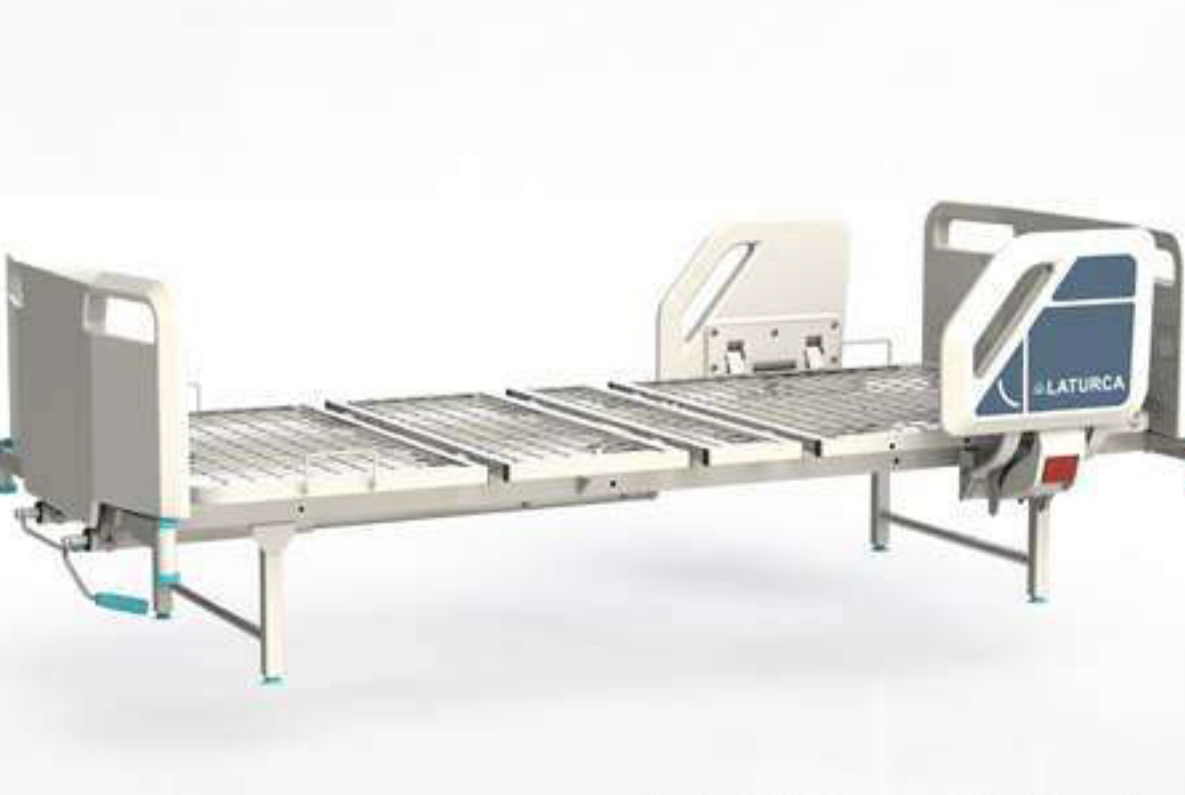
MCB - 259 / G