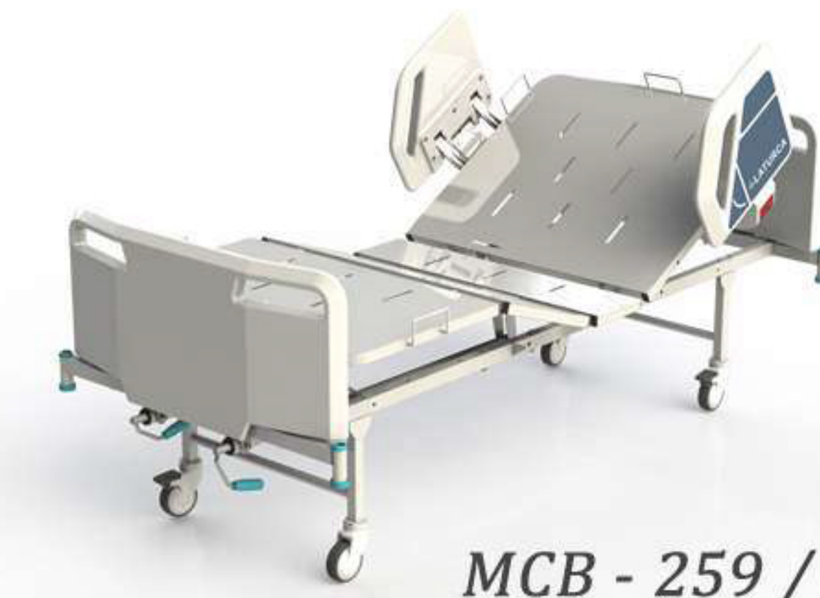
MCB - 259 / M