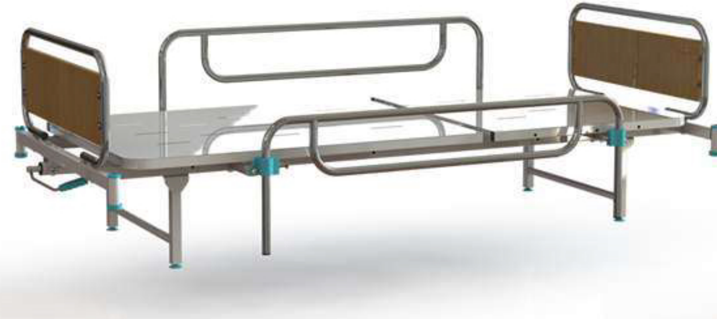
MCB - 144 / M