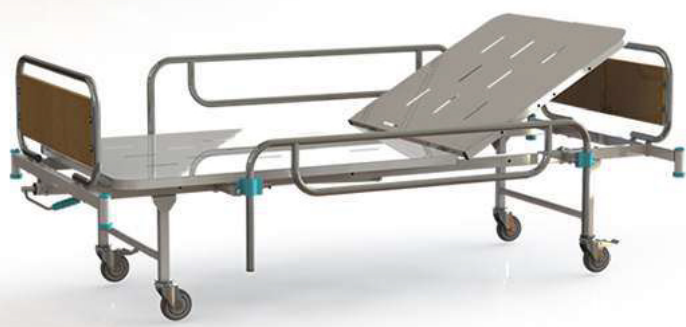
MCB - 144 / M