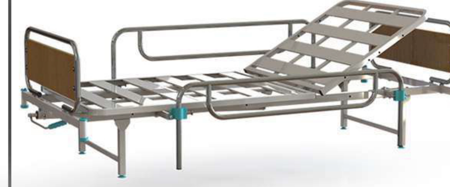
MCB - 144 / T