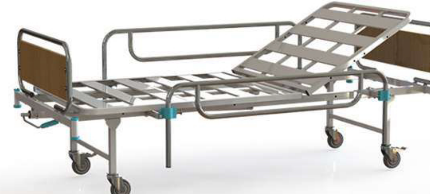
MCB - 144 / T