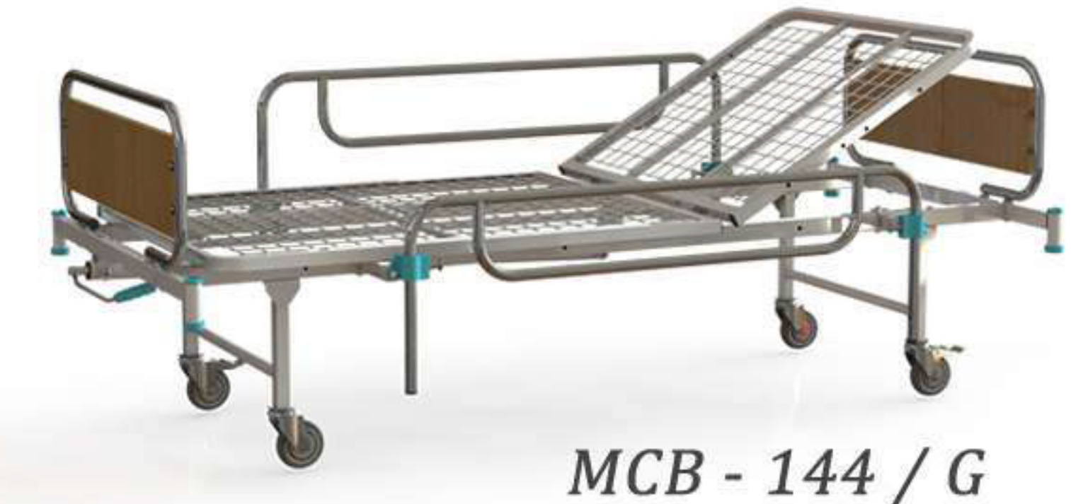
MCB - 144 / G