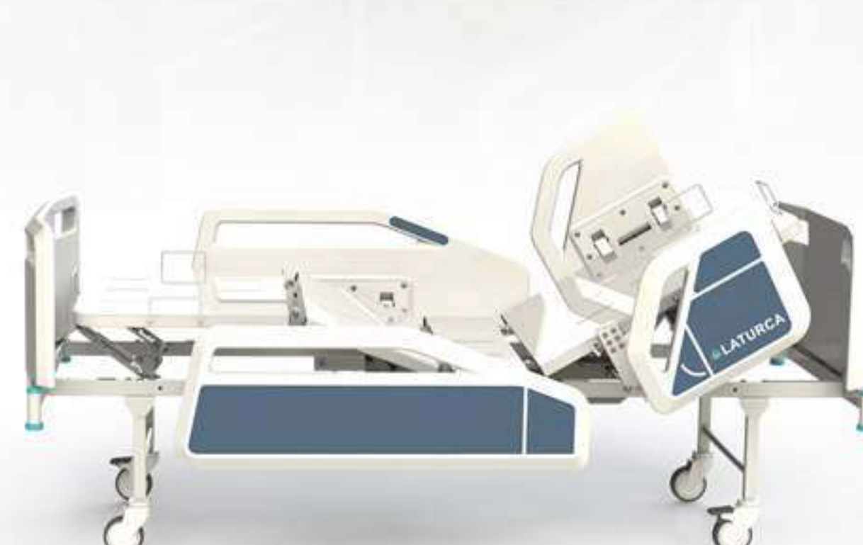
HB - 250 / M