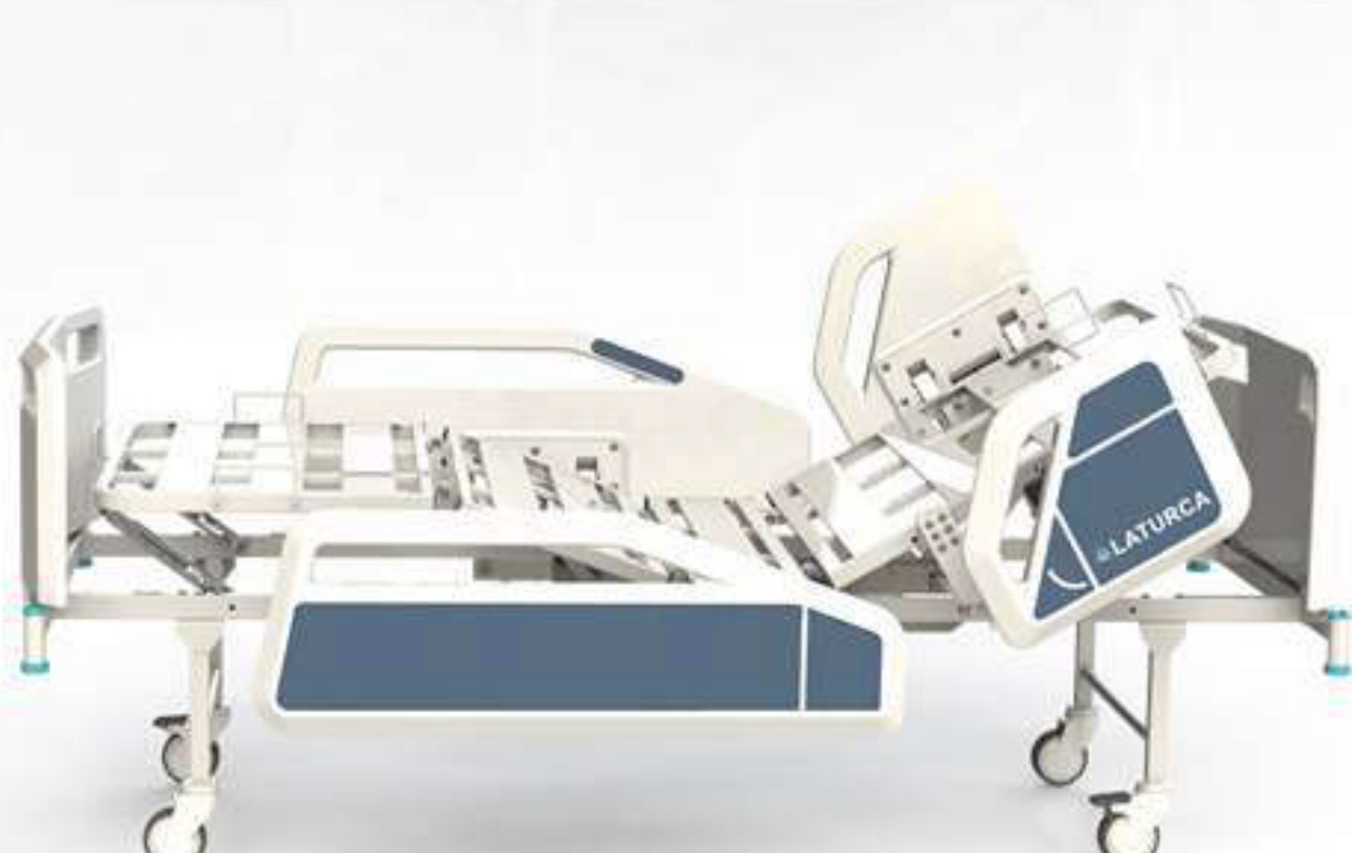
HB - 250 / T