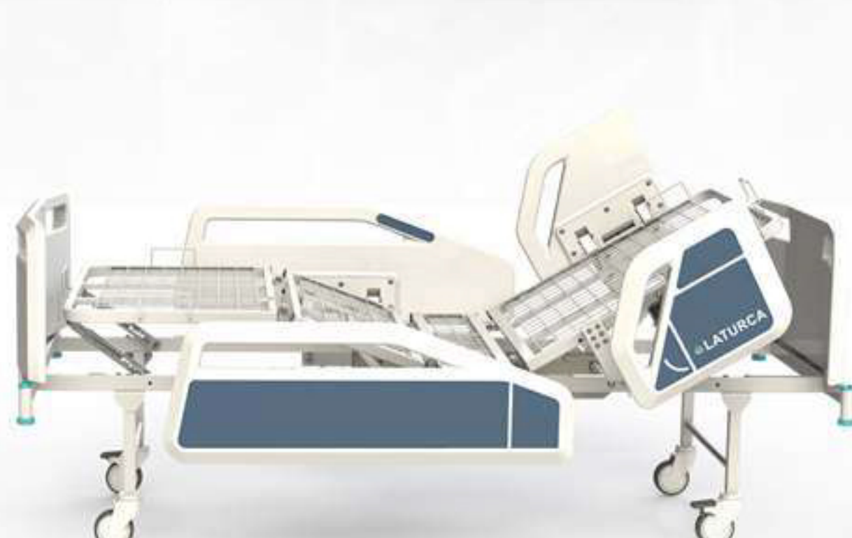
HB - 250 / G