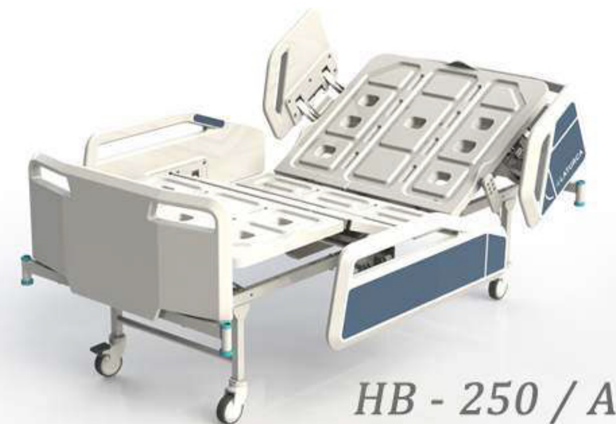
HB - 250 / A