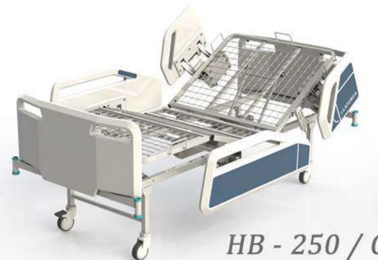
HB - 250 / G