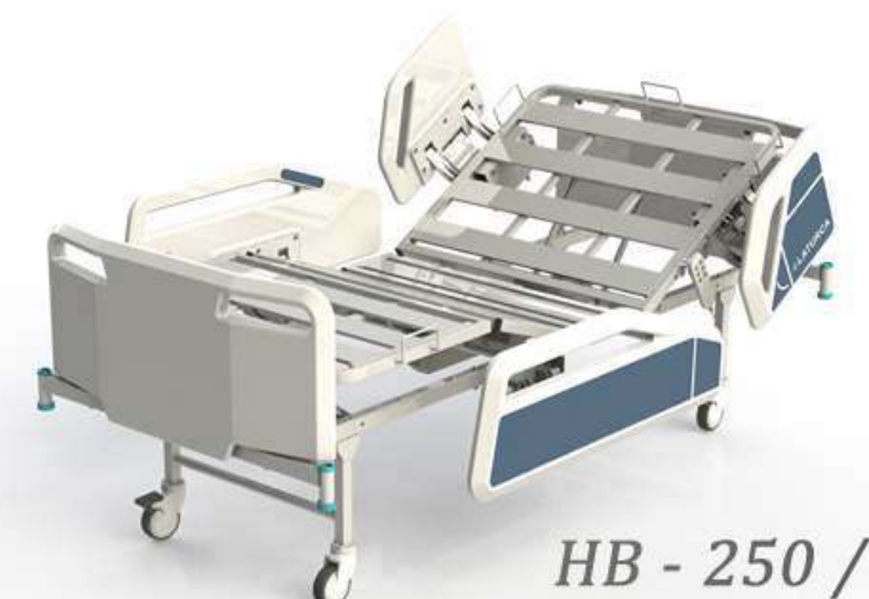
HB - 250 / T