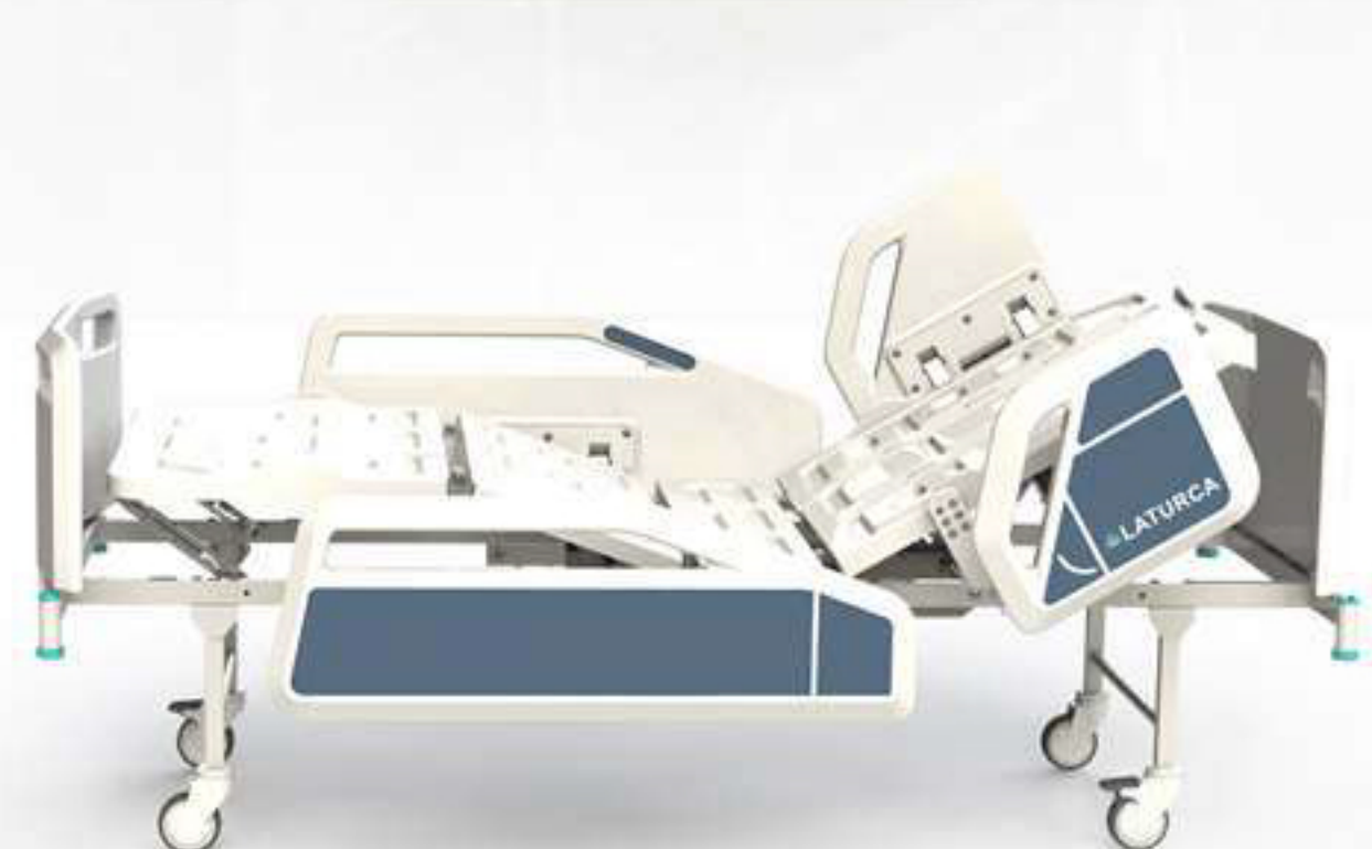
HB - 250 / A