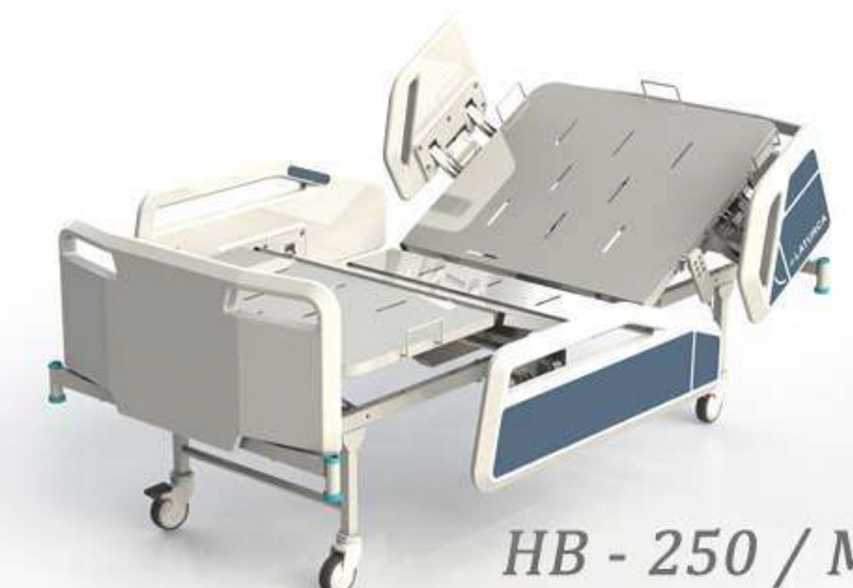
HB - 250 / M